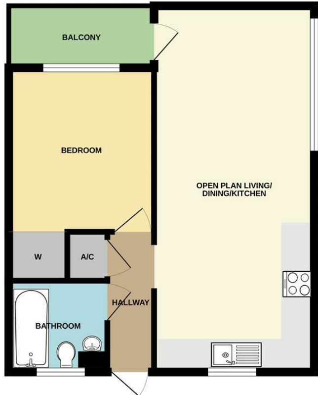
TOTAL FLOOR AREA : 624 sq.ft. (58.0 sq.m.) approx.

Whilst every attempt has been made to ensure the accuracy of the floorplan contained here, measurements of doors, windows, rooms and any other items are approximate and no responsibility is taken for any error, omission or mis-statement. This plan is for illustrative purposes only and should be used as such by any prospective purchaser. The services, systems and appliances shown have not been tested and no guarantee as to their operability or efficiency can be given. Made with Metropix ©2025